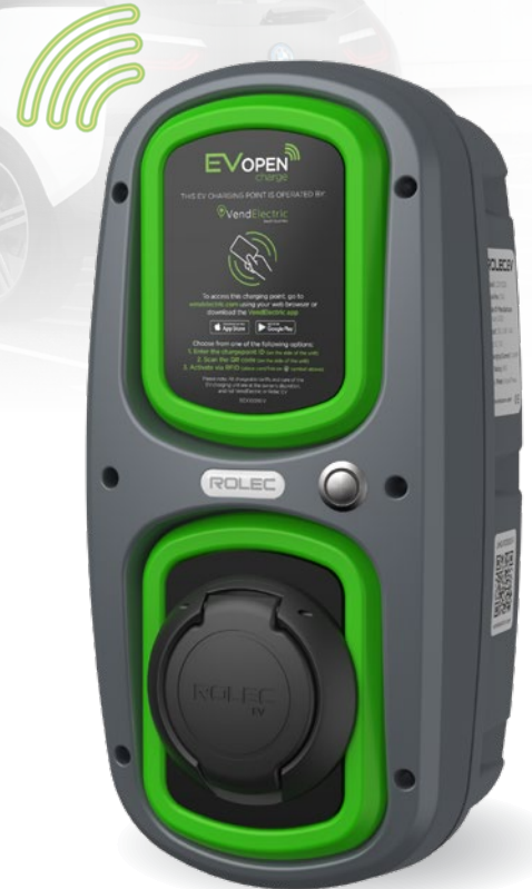
Unit shown: WALLPOD:EV EV OPENCHARGE Type 2, Mode 3 Charging Socket

The WALLPOD:EV OPENCHARGE charging unit has been designed as a simple to use, simple to manage, EV charger offering a variety of innovative features for both the EV driver and the charge point network operator.